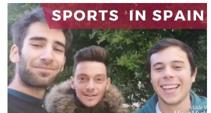
Sports in Spain