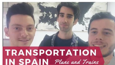
Transportation in Spain