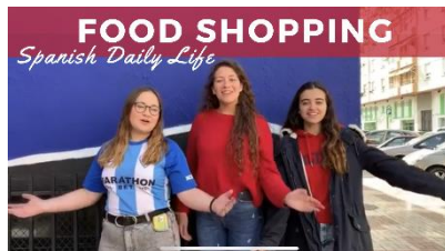
Food Shopping in Spain