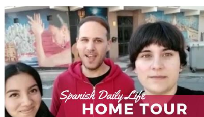
Spanish Home Tour