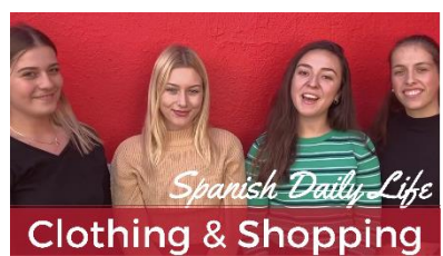
Clothing & Shopping in Spain